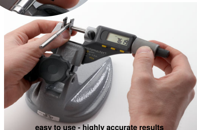
easy to use - highly accurate results

The selection and calculation aids listed below provide additional practical assistance.