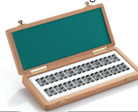
M+T thread measuring wires with holders in a set with commonly used diameters of the Zeiss series

In practice, you will often be working with a graded thread measuring wire diameter in accordance with the Zeiss thread measuring wire series. This can be found in DIN 2269 : 1998-11 / Table B.2. The following table was compiled with reference to this DIN standard.